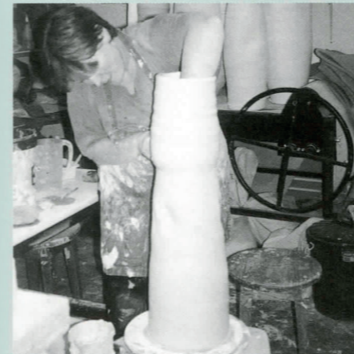
Second pull extends the height