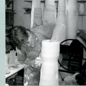
First pull of the second section