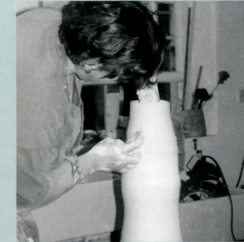
Finishing the form with a big rib