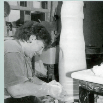
Trimming and undercutting the base