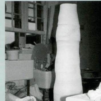
Considering the finished form