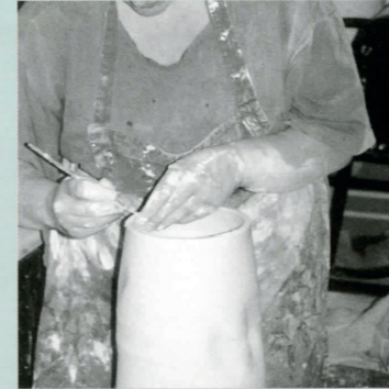
Scoring the rim of the base for the next section