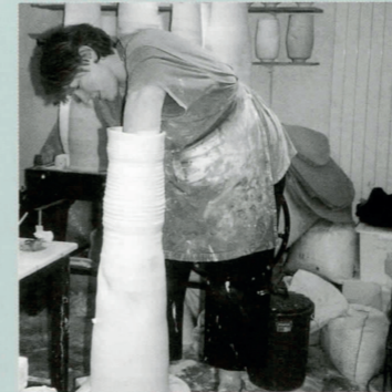
A further pull completes the throwing