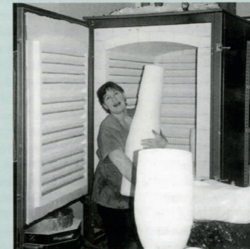
The bear hug method of carrying large work