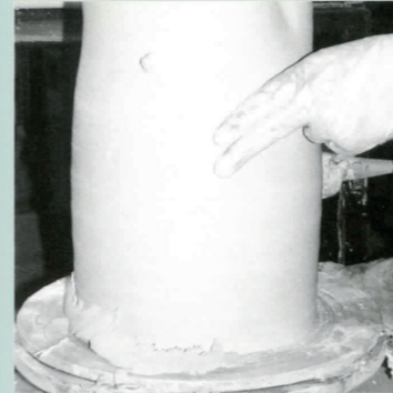
Making surface indentations in the base section