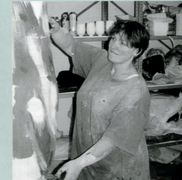
Painting - applying underglaze marks